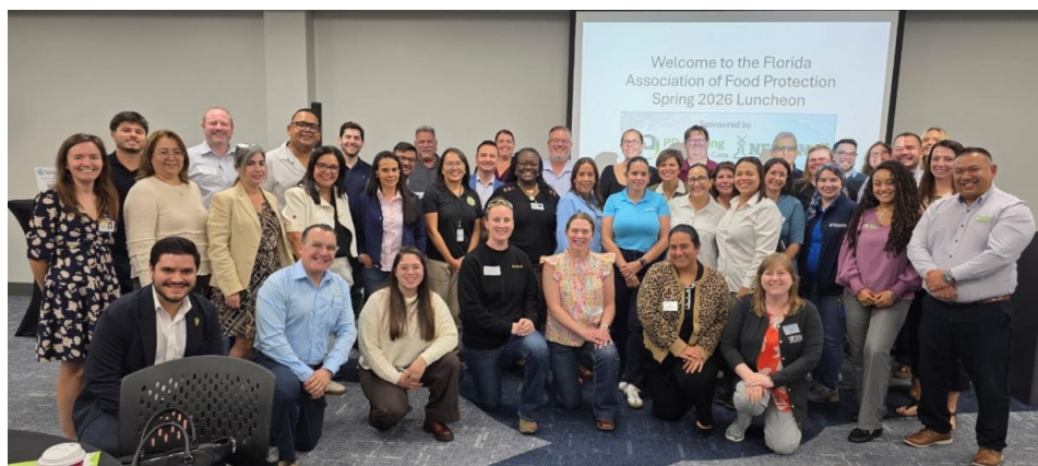
Members of the Florida Association for Food Protection pose at the Affiliate's Spring 2026 Luncheon on April 1.