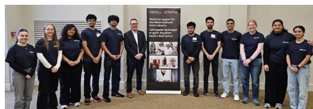
Student Ambassadors from Cardiff Met University were among attendees at the HELIX Programme Technical Conference in Cardiff.