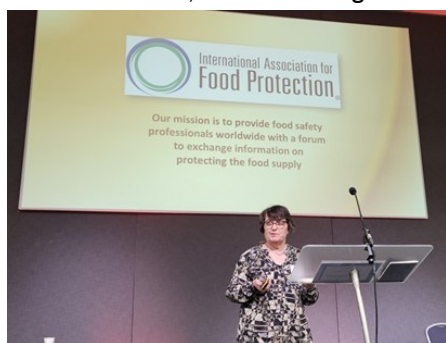
reflections on the food safety organizational culture from the past 20 years.